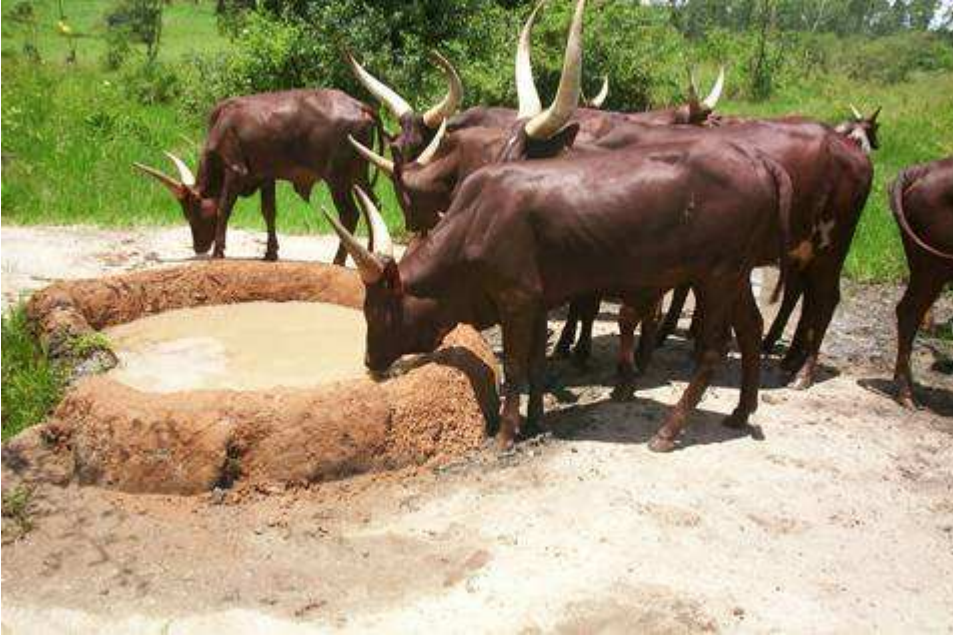
Watering Ankole cows at Nkoma Farm

Pastoralists rely on the traditional mud trough, giving water of very poor quality. Only the rich can afford to pump clean water to metal troughs. Pastoralist families use this muddy water for drinking, cooking and washing.