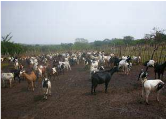
Exotic goats at Ssembuguya Estates, Ssembabule.

PENHA imported Boer and Toggenburg goats from South Africa, establishing a breeding center at Nkoma Farm, Masaka, where pure South African breeds as well as crosses with local Mubende goats are produced.