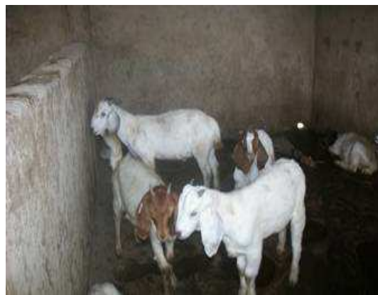
PENHA imported Boer goats from South Africa for breeding with local stock