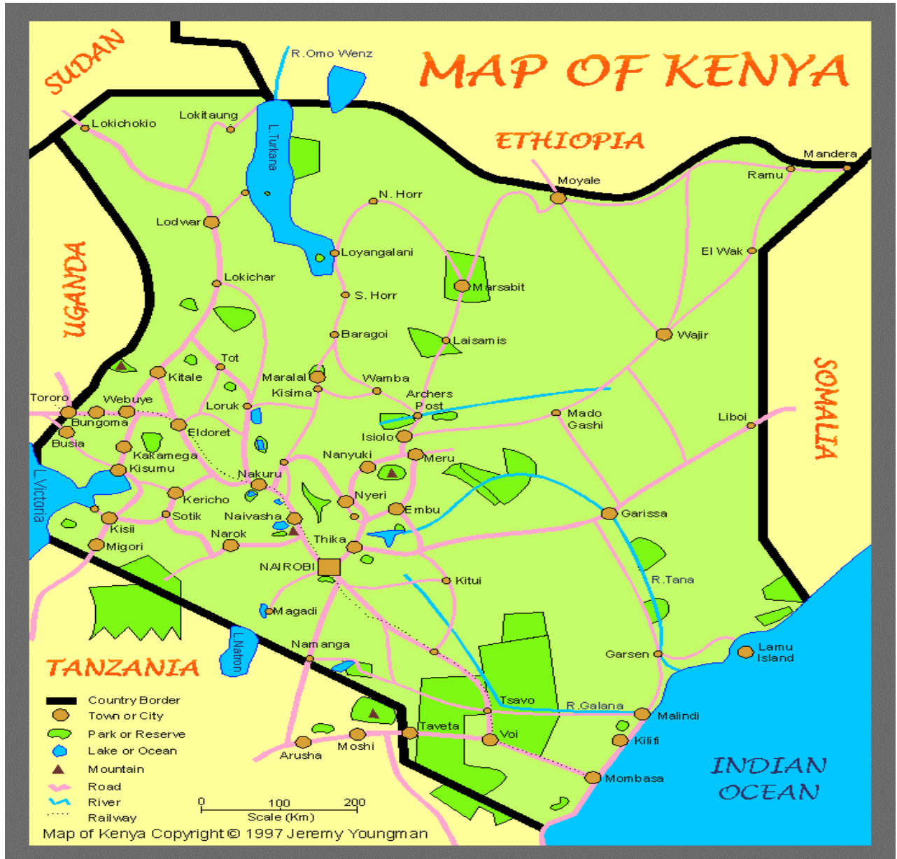
Appendix 1: Map 1. Showing mandera