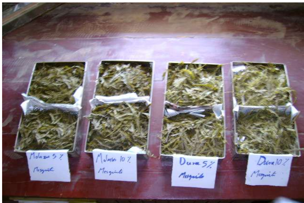
Mesquite leaves as silage combined with other ingredients.

Mesquite leaves silage was prepared by picking up leaves manually from mesquite trees around Animal Production Research Centre. The picked leaves were collected in plastic bags, weighed and then spread on plastic sheets at lots of 100 kg of fresh leaves each time. The crushed sorghum grains were spread over leaves at the rate of 5 % on fresh basis. Then mixed thoroughly and filled back into the plastic bags, tied and kept in an underground pit (2*3*1.5 m). The silage was left for one month at least before opening for animal feeding.